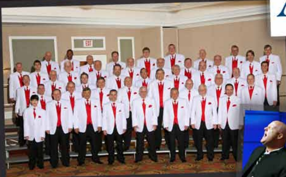
HEART OF AMERICA CHORUS

Don't miss this amazing show featuring award-winning world-class singing!