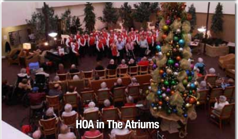
HOA in The Atriums