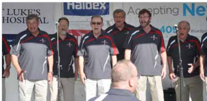
HOA Blue Springs Chorus