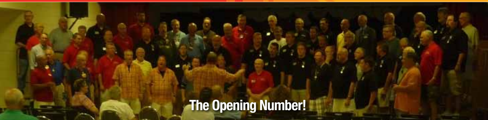
The Opening Number!