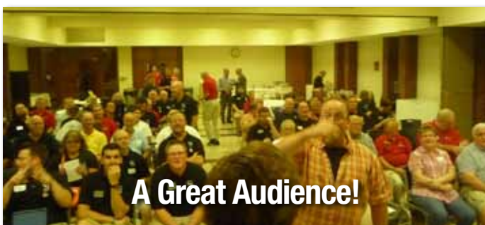
A Great Audience!