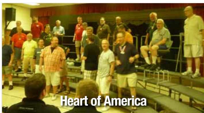
Heart of America