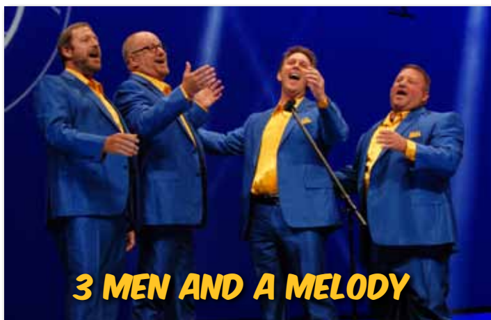
3 MEN AND A MELODY