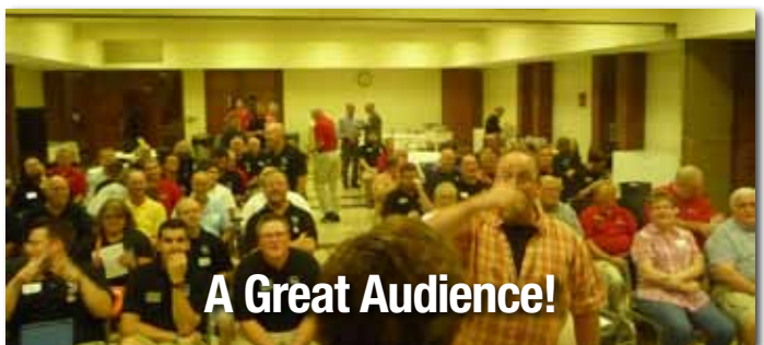
A Great Audience!