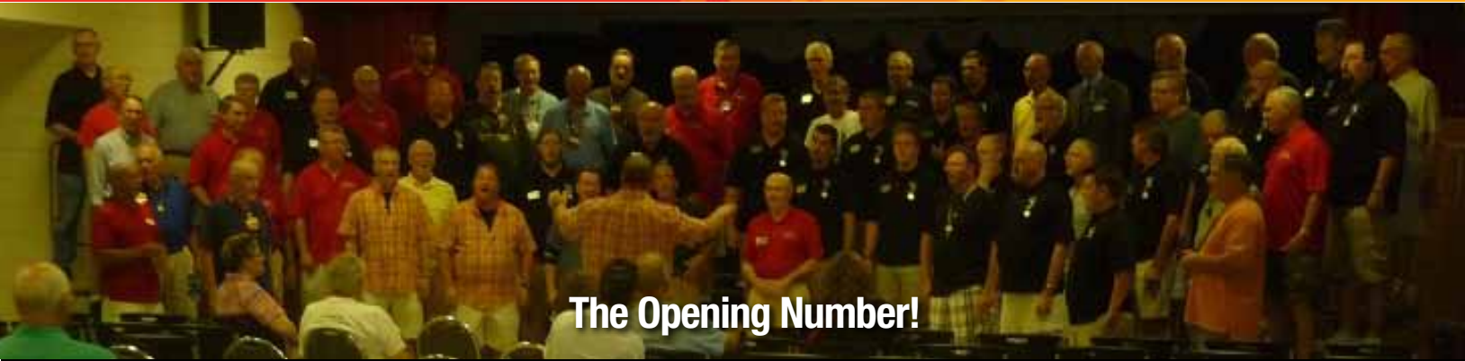
The Opening Number!