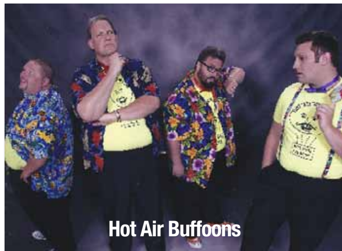
Hot Air Buffoons

One of the funniest quartets in the Barbershop Harmony Society descends on the Kansas City area this month when the Heart of America Chorus presents its 77th annual show. The Hot Air Buffoons , from Cleveland and Toledo, Ohio, will appear Saturday, Sept. 24, at the Performing Arts Theatre in suburban Liberty. Show times are 2 and 7 p.m.