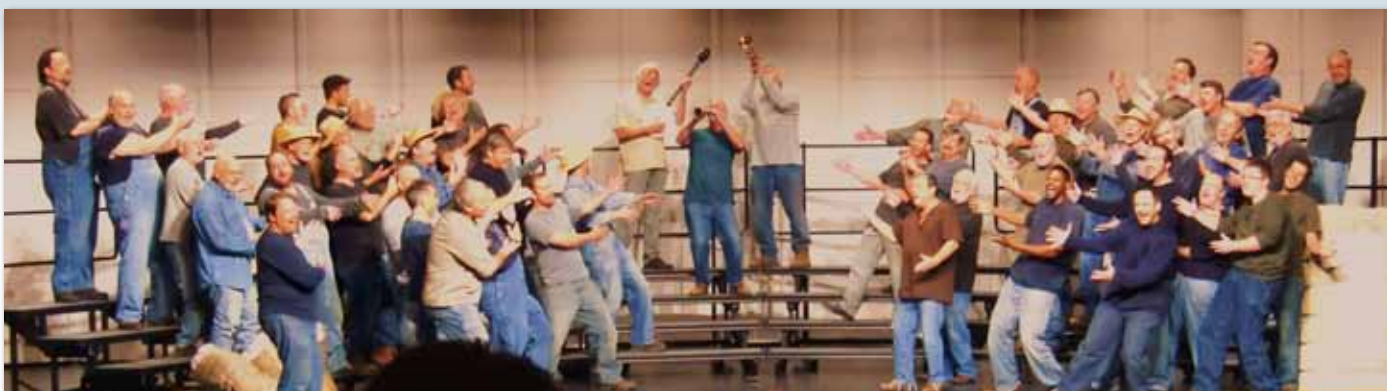
Above: Basin Street Blues - "... the band's there to meet us, old friends to greet us ..."