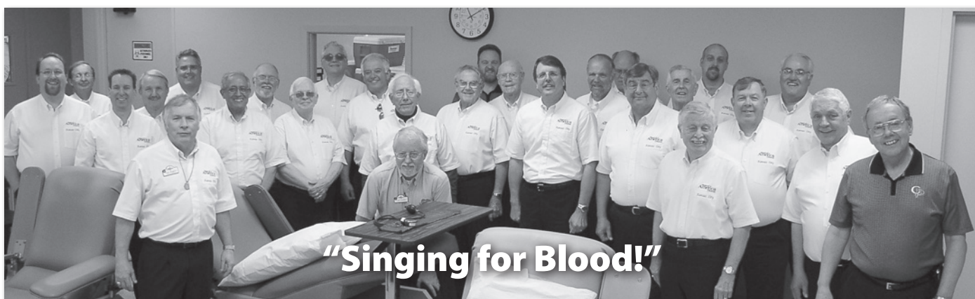
Above: HOA group at North Kansas City Center - 27 shown plus photographer plus two others who were present at earlier stops = 30!