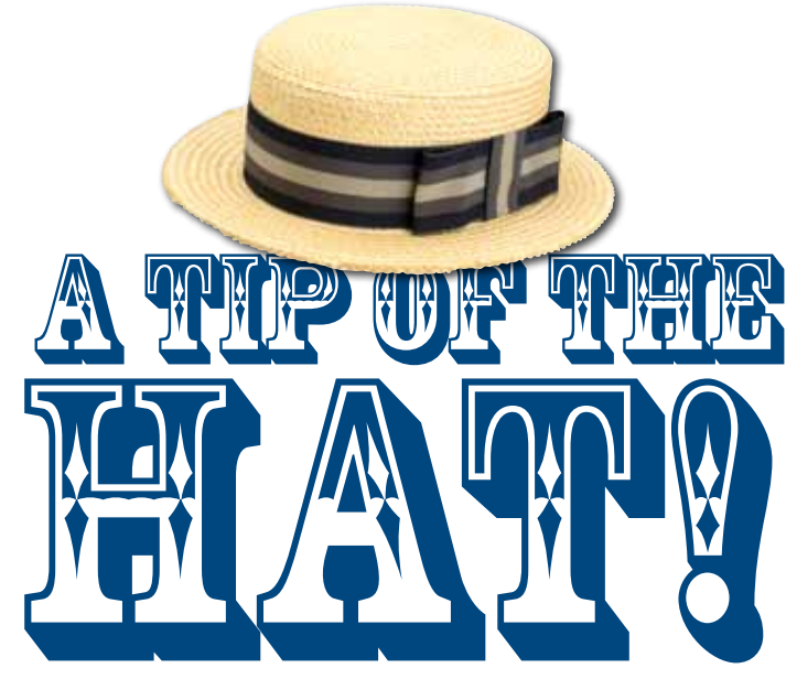
The Tip O' The Hat is recognition to both members and non-members who have made a recent contribution in time and effort to the betterment of the Kansas City, Missouri Chapter.

A big Tip O' The Old Noggin' Cover to all the HOA'ers who helped make the 2011 International Convention the best ever. There's no time nor way we can list or thank everyone.