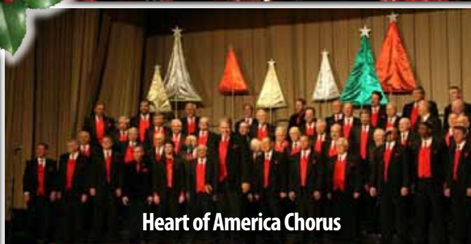
Heart of America Chorus