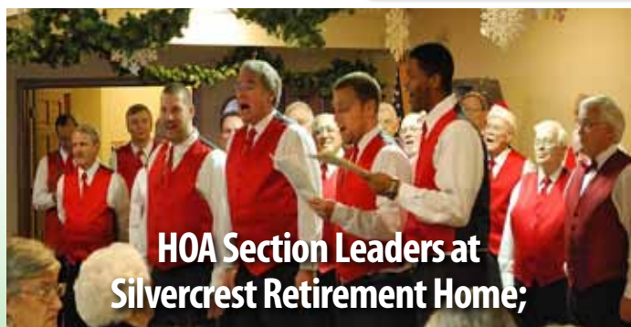
HOA Section Leaders at Silvercrest Retirement Home;