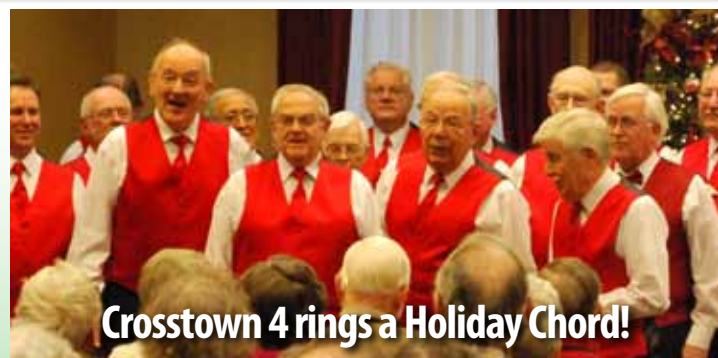
Crosstown 4 rings a Holiday Chord!