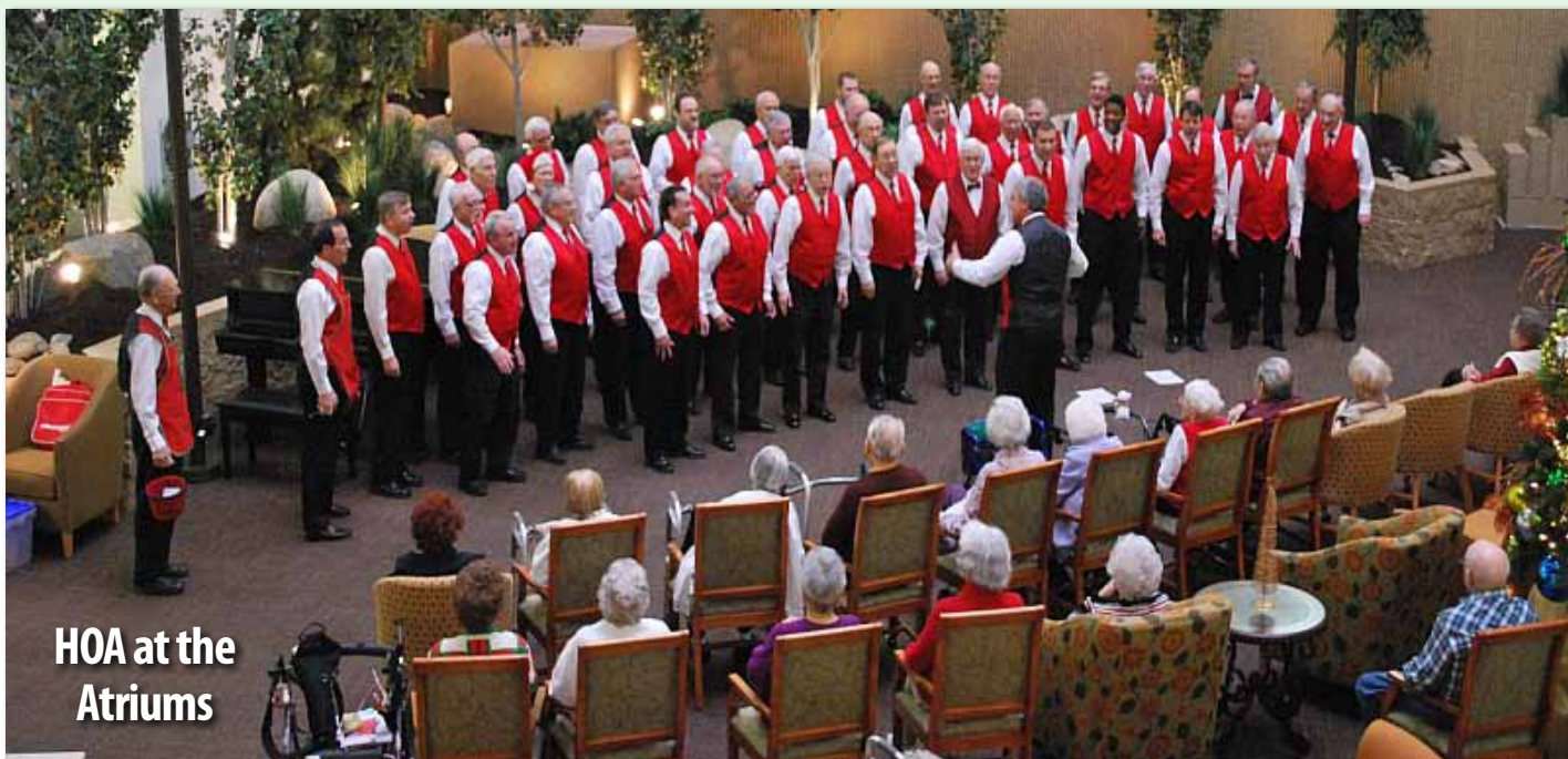
HOA at the Atriums