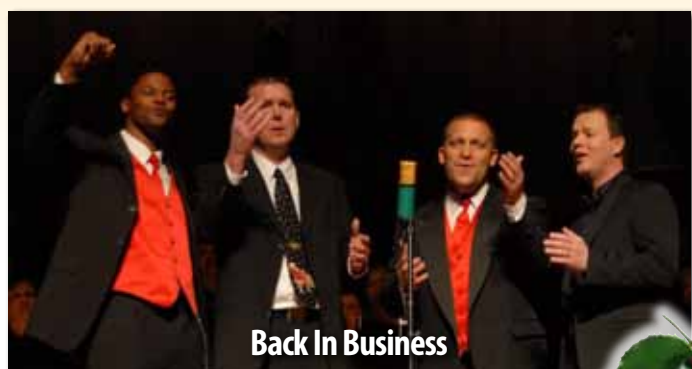
Back In Business