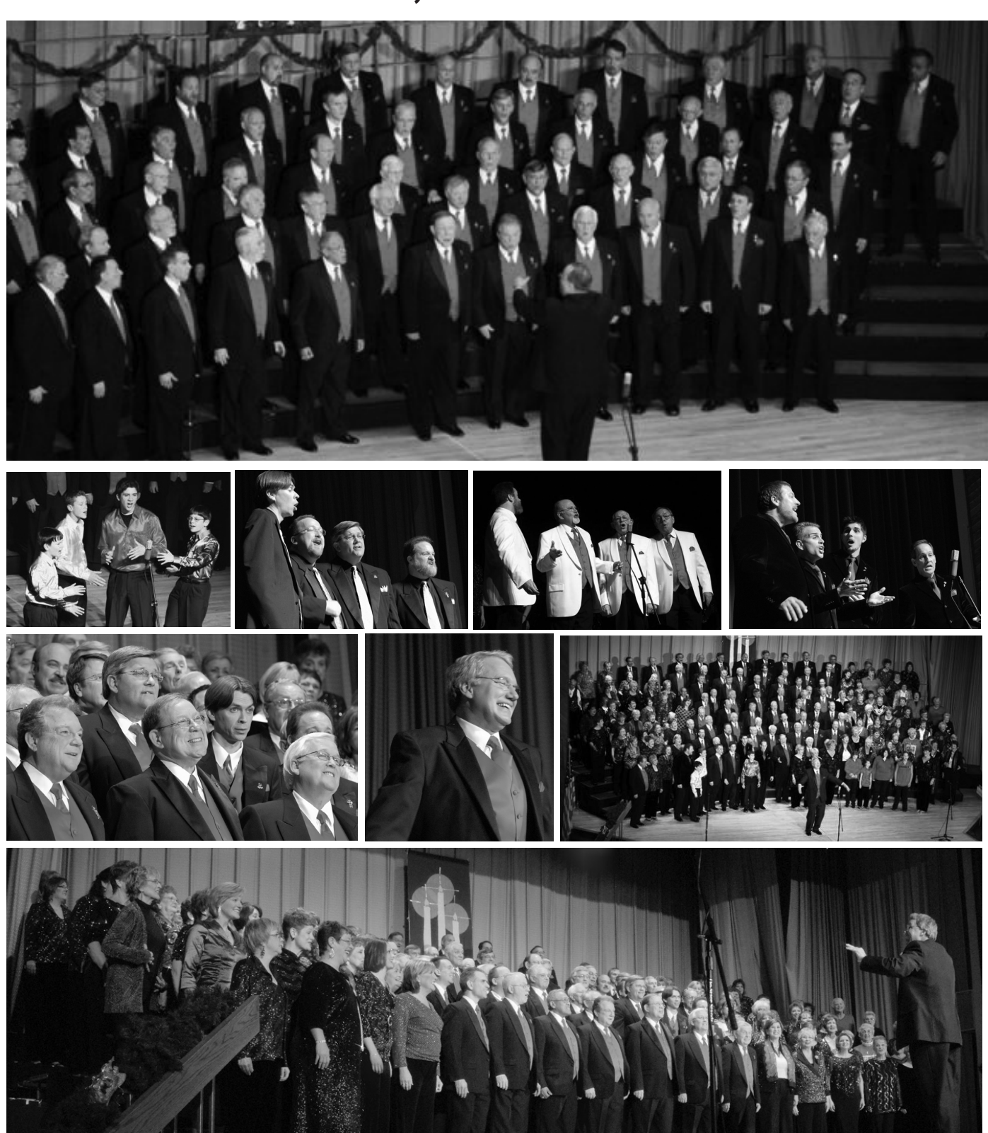
The Annual 2008 Holiday Show featured a stellar collection of music makers including the Heart of America Chorus, 5 The Kansas City Chapter of Sweet Adelines, and crowd-pleasing quartets!