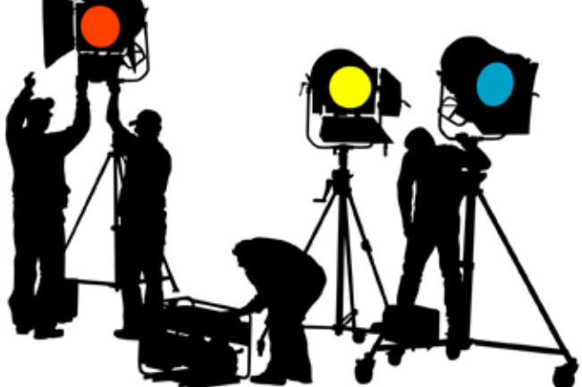
Introducing the newest members of the Chapter!