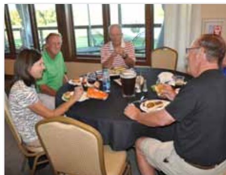
Dinner at one of the rounds