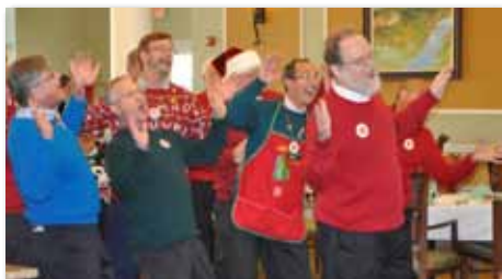
VLQ (Very Large Quartet) sings "Hanukkah in Santa Monica"