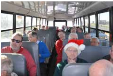
On the caravan bus!

All group shots are shown left to right