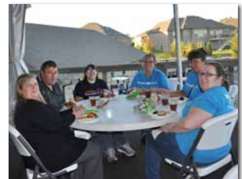
Kohls volunteers enjoying some chow