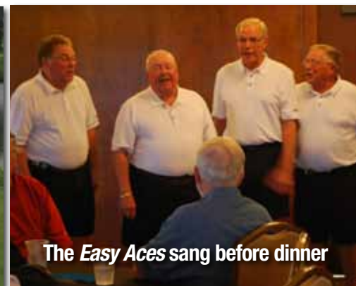
The Easy Aces sang before dinner

It took me seventeen years to get three thousand hits in baseball. I did it in one afternoon on the golf course.