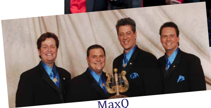
MaxQ 2007 International Quartet Champions