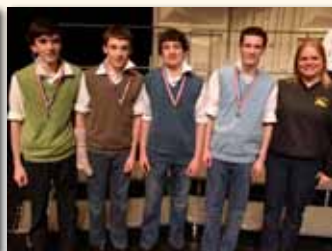
Sweater Vests California Trail Jr.