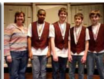
Three Guys & a Tenor Pioneer Trail Jr. HS