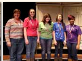
The Accidentals Pioneer Trail Jr. HS