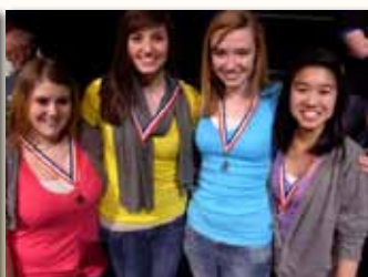
B Dazzled Olathe East HS