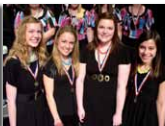
Footnotes Olathe East HS