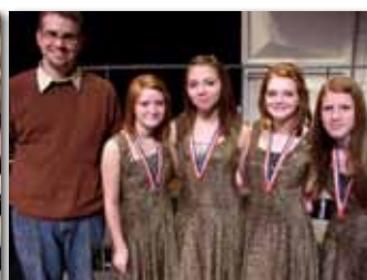
The Quarter Quartet Wichita West HS