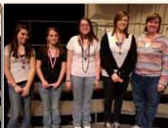
Sister Act Pioneer Trail Jr. HS