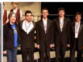
The White Notes Olathe Northwest HS