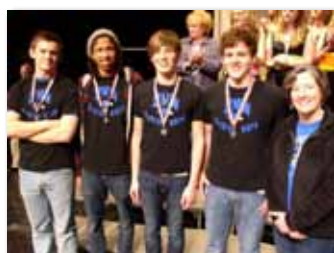
Grady & The Goonies Olathe Northwest HS