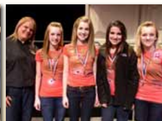
Lady Lions California Trail Jr. HS