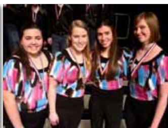
Good Question Olathe East HS