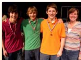
Four Crazy Guys Pioneer Trail Jr. HS