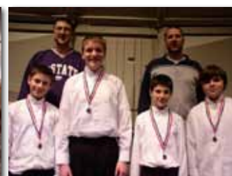
The Jaguars Frontier Trail Jr. HS