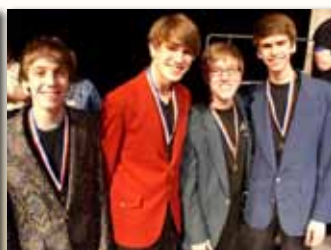
Sudden Impact Olathe East HS