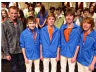
Thrill Ride Olathe East HS