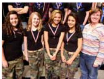
Sweet Talk Pioneer Trail Jr. HS