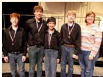
Men in Black Pioneer Trail Jr. HS