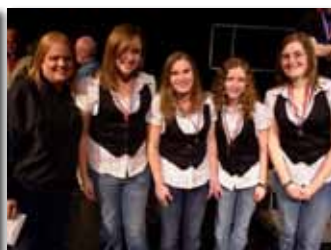
Melodia Linda California Trail Jr. HS