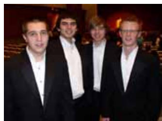
Stag Notes Bishop Miege HS