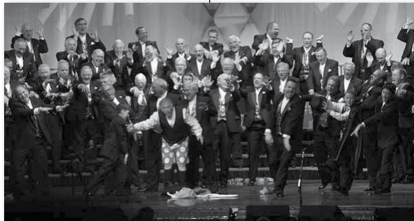
Denver

responds to my suggestions and directions. Even the Music Team has more advice than ever before, and sometimes conflicting feedback on my approach. Most telling, despite "what the survey says," is the lack of commitment, as indicated by the number of dropouts—particularly in this contest cycle. If I had any doubts about whether I've made the right decision, the number of clothespins I was pulling week after